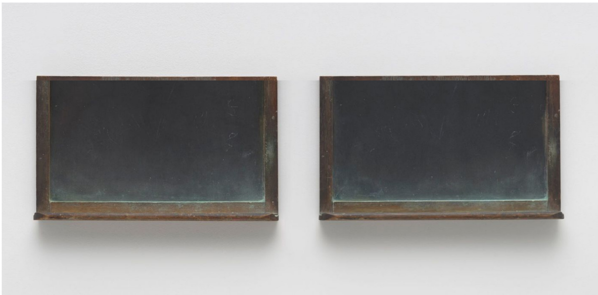
Vija Celmins, "Blackboard Tableau #14," 2011-15. One found object and one made object (alkyd oil, acrylic and pastel on wood), each: 18.75 inches by 24 inches by 2.5 inches.

Twice in Vija Celmins' quietly gripping show at Matthew Marks Gallery, we face seemingly identical wood-framed chalkboards, hanging side by side. In each pair, one is an old, found object, and the other is a recently made one. To scrutinize them for clues as to which is which is to get ensnared by the how , the technical agility at play, and to relegate the artwork to the status of solvable puzzle.