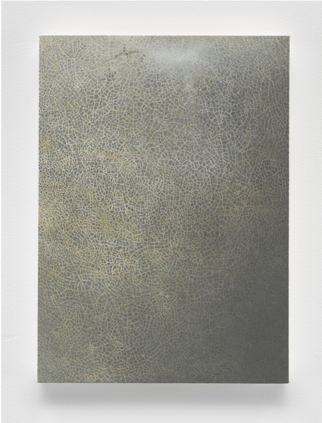
Vija Celmins, "Untitled," 2017-18. Oil on canvas. 18 inches by 13 inches.

Matthew Marks Gallery, 1062 N. Orange Grove Ave. and 7818 Santa Monica Blvd., West Hollywood. Through March 31; closed Sundays and Mondays. (323) 654-1830, www.matthewmarks.com