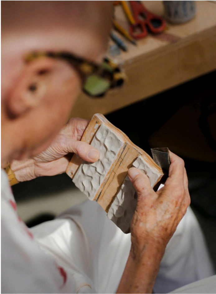
Inspired by Japanese Momoyama ceramics from the 17th century, Nagle's sculptures are meticulously produced and possess a wabi-sabi sensibility. Damien Maloney