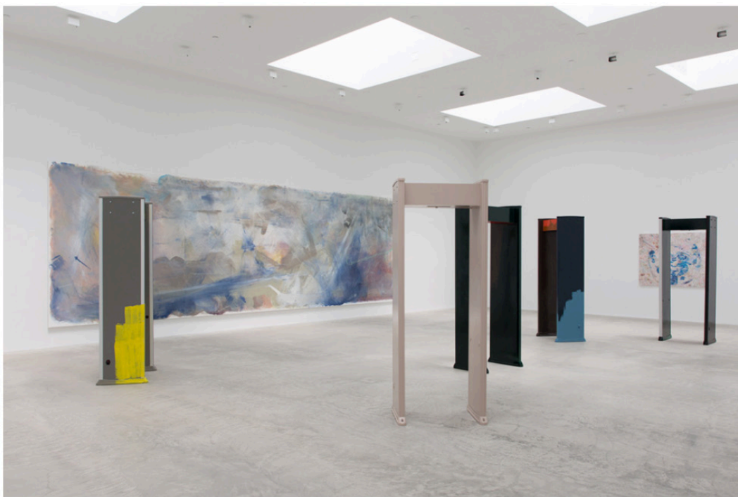
5 / 5 Installation view of “The Male Gates” at Matthew Marks Gallery, Los Angeles, April 14–June 30, 2018. © Reena Spaulings, Courtesy Matthew Marks Gallery.

Walking through the detectors is an almost harrowing moment of viewership. They're not on, no officers wave you through, no alarms go off, but the glossy panels press in close; you can see your reflection in their sheen, and you can smell the new paint. From across the room, a series of smaller paintings (Medusas, 2018) seem to nestle inside the metal detectors'