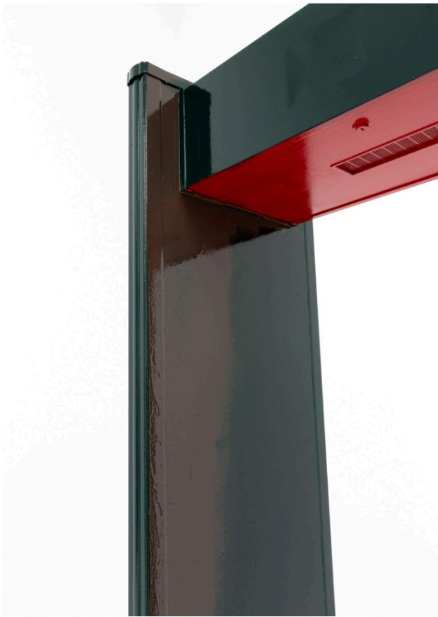
3 / 5 Reena Spaulings, Detail of Gate 2 , 2018. Enamel paint on security gate, 87 x 32 x 23 inches, 221 x 81 x 58 cm. On view as part of "The Male Gates" at Matthew Marks Gallery, Los Angeles, April 14—June 30, 2018. © Reena Spaulings, Courtesy Matthew Marks Gallery.