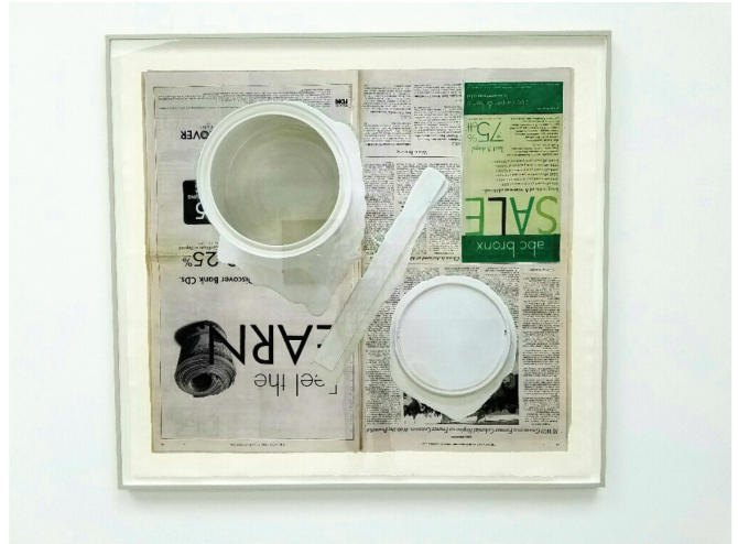
Paul Sietsema, "Figure ground study (50/50)," 2016, ink and enamel on paper in artist's frame.

Inquisitive rather than critical, Sietsema's work is neither disparaging of art and commerce nor a celebration of it. He instead looks squarely at present reality — and then fabricates marvelous art of it.