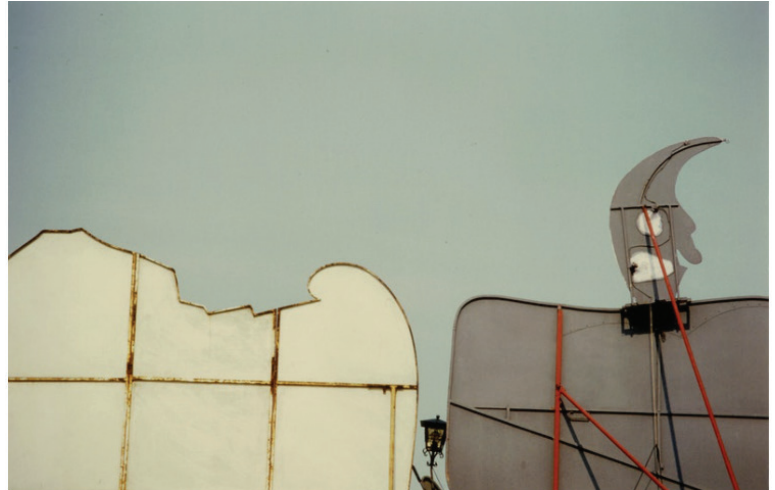
Luigi Ghirri, Modena , from the series "Il paese dei balocchi," 1978. Vintage c-print, 7 3/4 x 11 5/8 inches. © The Estate of Luigi Ghirri, Courtesy Matthew Marks Gallery.

The exhibition is curated by the artist Matt Connors, and comprises 29 vintage prints together with archival material, handmade exhibition invitations, books, commercial work, presented in vitrines.