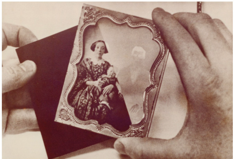
Luigi Ghirri, Modena, from the series "Still Life," 1979. Vintage c-print, 10 1/4 x 15 inches.