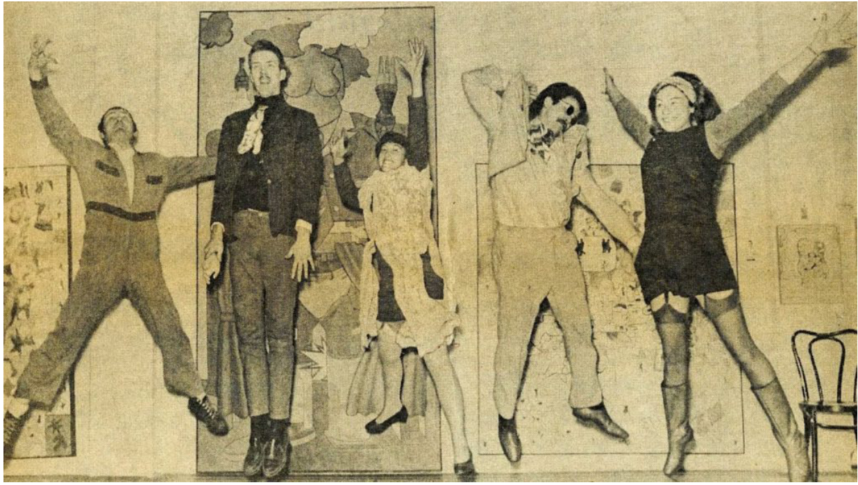
The Hairy Who in Hyde Park, Chicago.