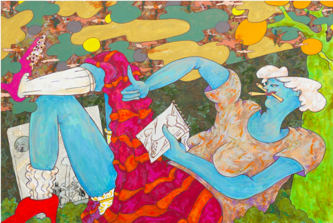
Gladys Nilsson, Plain Air (2018).

Gladys Nilsson was beaming. On a recent afternoon the artist—a member of the Chicago group the Hairy Who, a once-fringe movement that's increasingly beloved—was strolling through the galleries at Matthew Marks and Garth Greenan, admiring the precise curatorial choices in a much-anticipated fifty-year survey of her work.