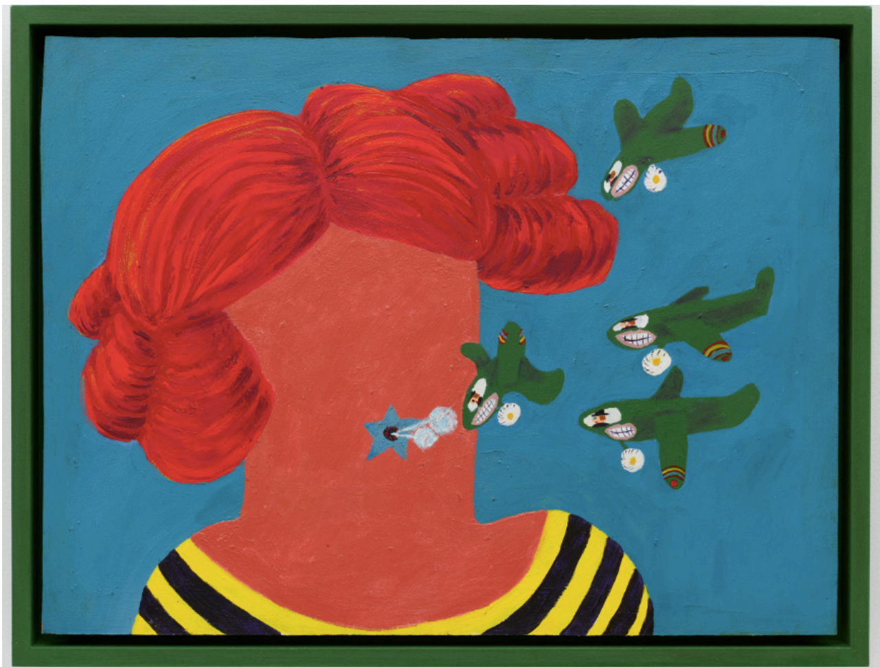
Gladys Nilsson, Gigantica und der Messerschmitts (1965).

“I'm always fond of having other people think about what they'd like to read into it,” she says of her paintings. “I've always felt the viewer has to work for it, too.” In the work Gigantica und der Messerschmitts (1965) a giant, faceless figure with a swathe of fire-engine red hair is assaulted by tiny green planes; a star-shaped puncture where her mouth should be sends out two whiffs of air, like a balloon deflating.