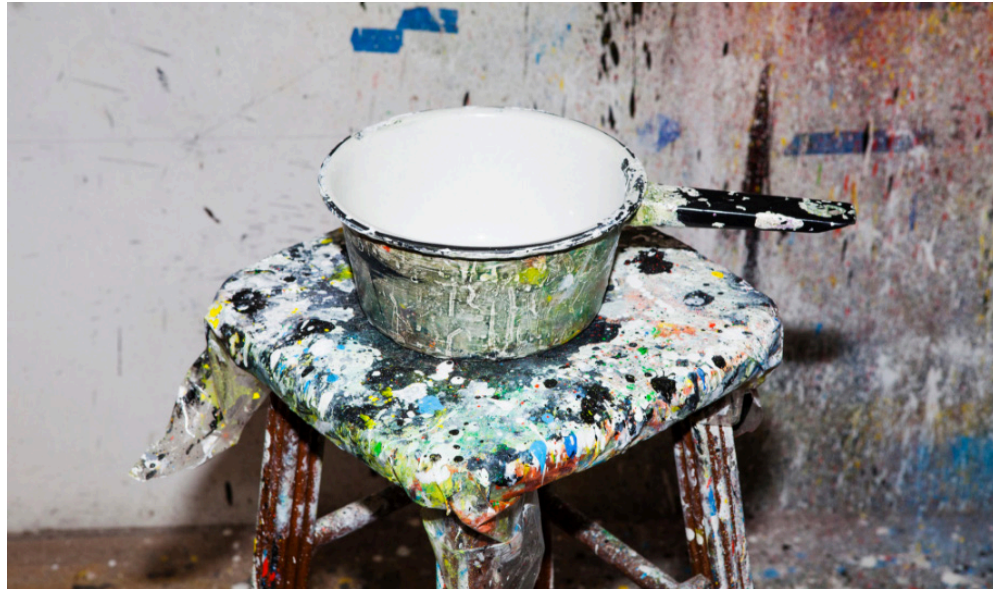
Items in the studio left as they were the last time Kelly painted